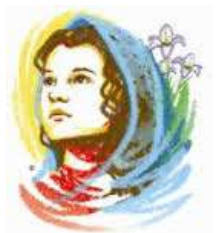
Saint Maria Goretti