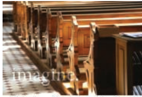
imagine Helping Our Parish Grow WEEKLY OFFERTORY