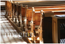
Helping Our Parish Grow WEEKLY OFFERTORY

Thank you to the parishioners of SMG that are able to continue to support the parish. Your generosity makes it possible to continue the wonderful ministries and programs within our parish. We are also able to continue to help those in need through our very generous Saint Vincent DePaul ministry. May God continue to bless all of you for your continued support!