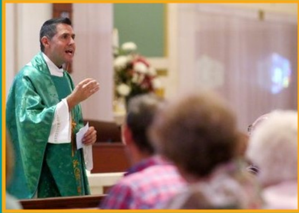
FORTY HOURS AT ST. MARIA GORETTI PARISH

SEPTEMBER 25, 26 & 27 EACH EVENING AT 7:00PM