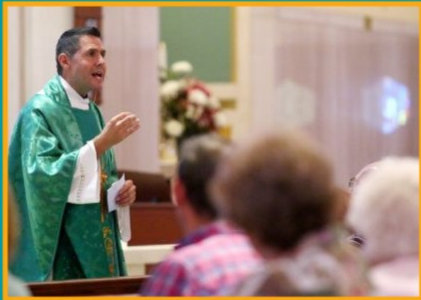
FORTY HOURS AT ST. MARIA GORETTI PARISH

SEPTEMBER 25, 26 & 27 EACH EVENING AT 7:00PM