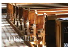
Helping Our Parish Grow WEEKLY OFFERTORY

Thank you to the parishioners of SMG who are able to continue to support the parish. Your generosity makes it possible to continue the wonderful ministries and programs within our parish. We are also able to continue to help those in need through our very generous Saint Vincent DePaul ministry. May God continue to bless all of you for your continued support!