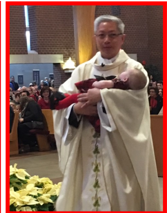
Christmas Pictures 2017