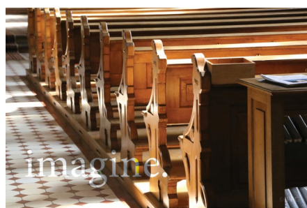
Helping Our Parish Grow WEEKLY OFFERTORY