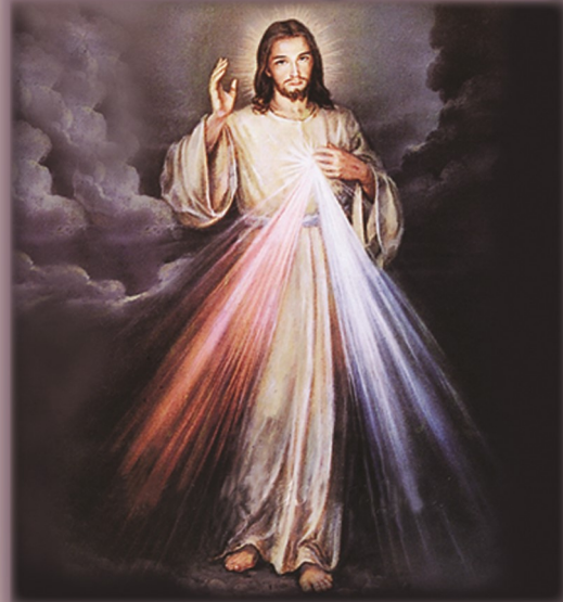
Jesus I Trust In You